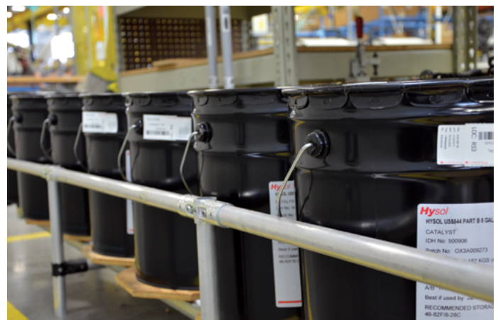
ePlus works with large and small inventory items.