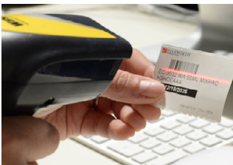
An ePlus scanner and labeled products.