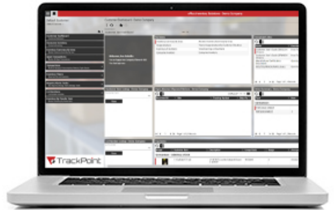
A screenshot of ePlus' inventory page.

ePlus is a web-based inventory management program for adhesives, specialty chemicals, tapes, consumables, and other similar products provided by Ellsworth Adhesives. It has multiple components that can be customized to fit each customer's needs including comprehensive product tracking, multiple reporting options,